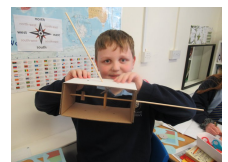
Year 3 and 4 making models with moving parts