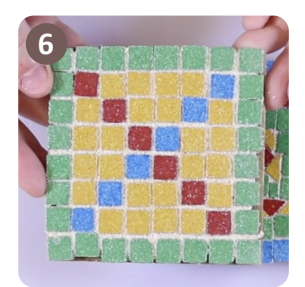
Leave the grout to dry.

strip that goes around the edge of something.