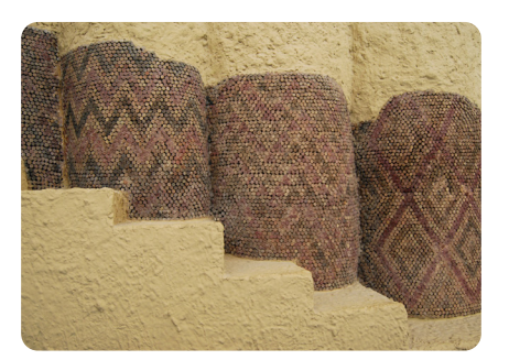
Columns decorated with clay cone mosaics, c3000 BC

Mosaics have been used since c3000 BC and are still used today.