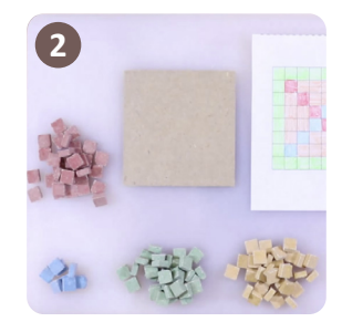
Sort tesserae by colour.