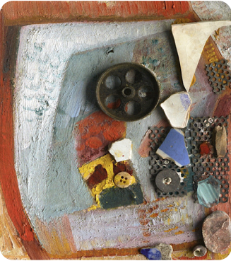
Merz Picture with Porcelain Fragments by Kurt Schwitters, 1945–1947

The German artist, Kurt Schwitters, lived from 1887–1948 and is famous for his mixed media collages called ‘Merz pictures’. Artists who create mixed media collages use different joining methods, including gluing, stitching and tying.