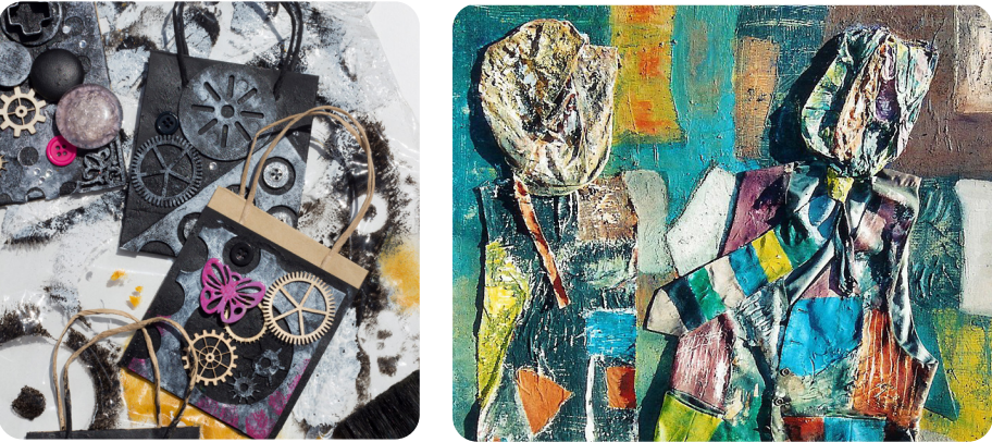
mixed media collages

The term ‘mixed media’ describes artwork that uses more than one medium, such as paper, fabric, photographs and 3-D objects, like buttons. Collage is a type of mixed media art.